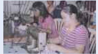
SI/Mandaluyong, Philippines, received a $5,000 Soroptimist Club Grant for its Participatory Project, which teaches livelihood skills to women.

The Soroptimist Club Grants for Women and Girls program offers cash grants in support of innovative community projects that make a real difference in the lives of women and girls. Addressing a variety of specific local needs, projects include offering computer skills training, helping women with free breast cancer screenings and providing support to domestic violence victims.